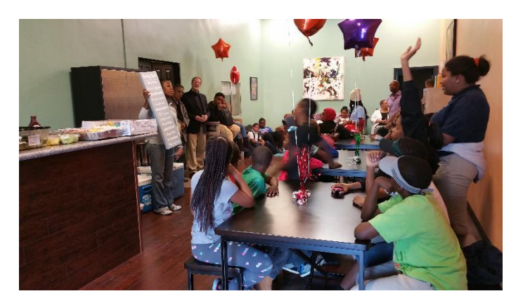
Faye Family Room dedication on Feb 27, 2015