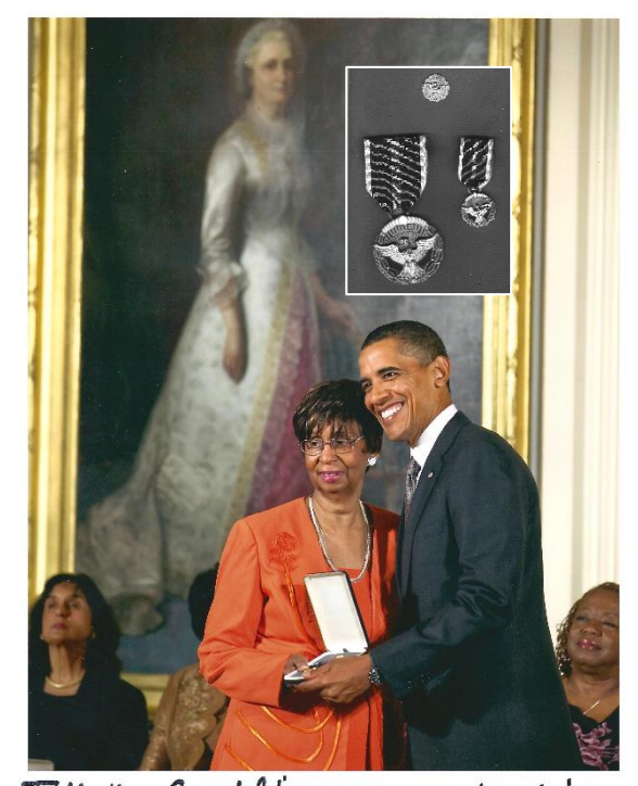
To Myrke - Conquetulations on your great work!